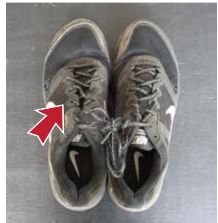
• Uppers are too worn, dry and cracked.