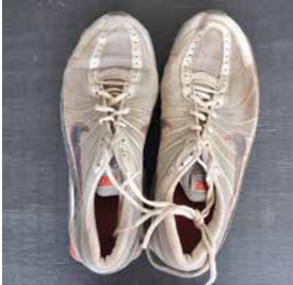
• Clean, good condition