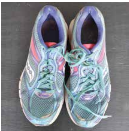
• Laces intact, lots of life left