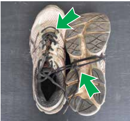
• Still wearable, rinsed, good condition; zip tied together