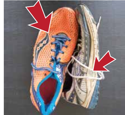
• Mismatched pair. Not bound together.